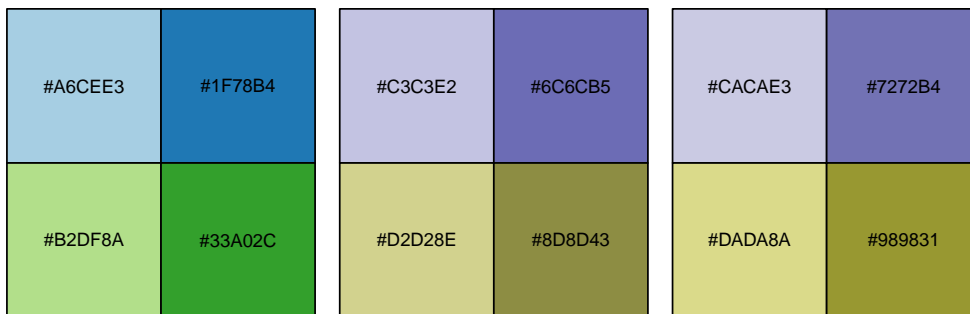
Figure 1: Checking colors with two common type of color blindness. The first one is normal perception, second one for deuteranopia and last one for protanopia. Since we are using selected color palettes in this package, it should be fine with those types of blindness.

> ## for palette "Paried" > mypalFun <- colorBlindSafePal(21) > par(mfrow = c(1, 3)) > showColor(mypalFun(4)) > library(dichromat) > showColor(dichromat(mypalFun(4), "deutan")) > showColor(dichromat(mypalFun(4), "protan"))