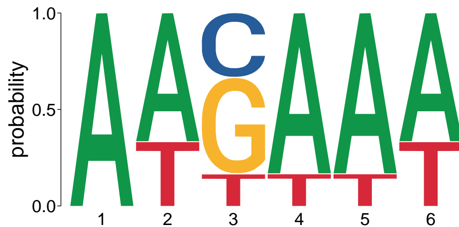
Figure 1: Sequence logo of a Position Probability Matrix