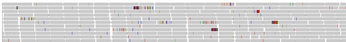
Figure 3: Simulated reads mapped in proper pair. Mismatches and soft-clips are shown as colored vertical lines in reads.