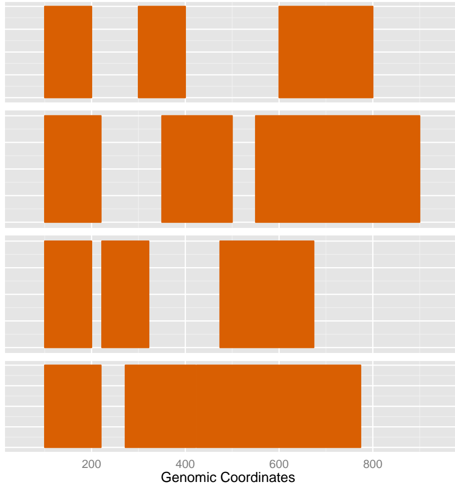
Figure 6: shrinkageFun demonstration for multiple GRanges, the top two tracks are the original tracks, please note how we clipped common gaps for those two tracks and shown as bottom two tracks.