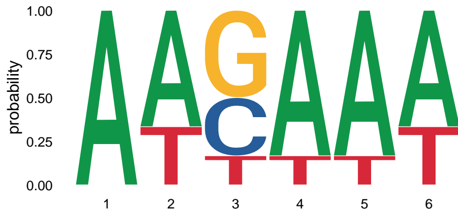
Figure 1: Sequence logo of a Position Probability Matrix