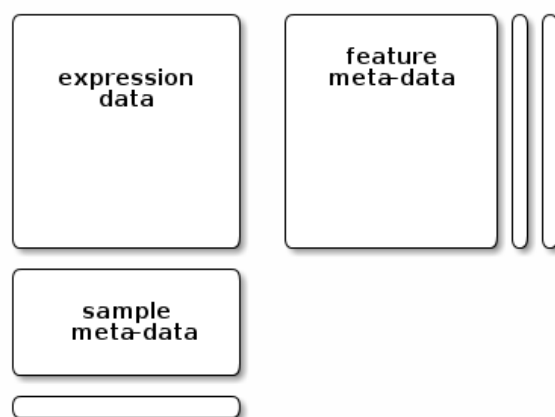
Figure 3: Dimension requirements for the respective expression, feature and sample meta-data slots.