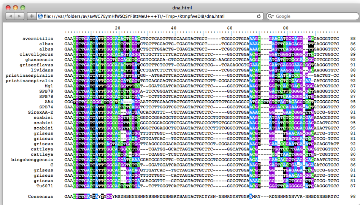
Figure 2: Amplicon with the target site for each primer colored